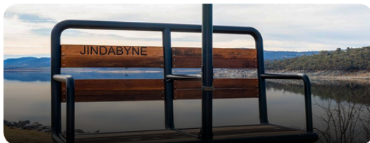
PHOTO STOP & FORESHORE WALK

Start your foodie weekend with breakfast at Parc Café, next to the Visitor Information Centre. Browse local arts and crafts, pick up free walking maps and get ready for your foodie adventure.